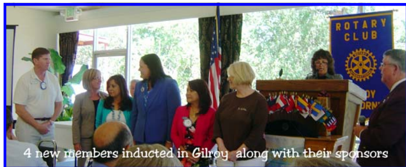
4 new members inducted in Gilroy along with their sponsors