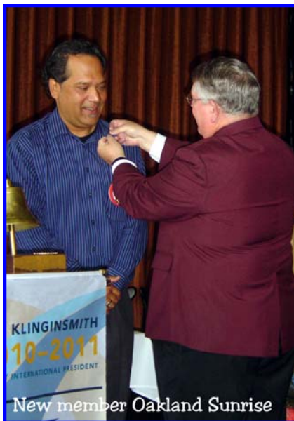
New member Oakland Sunrise