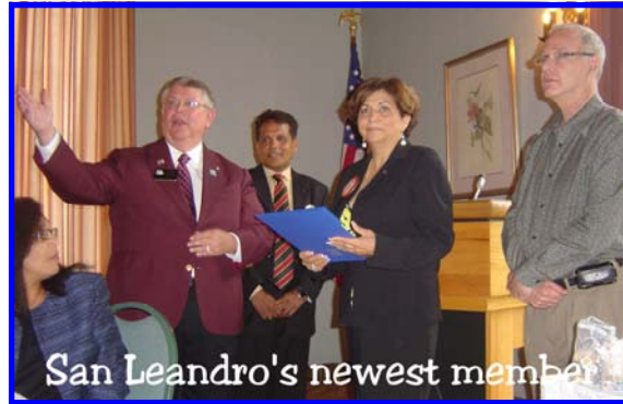
San Leandro's newest member