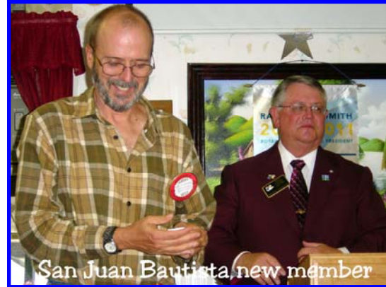
San Juan Bautista new member