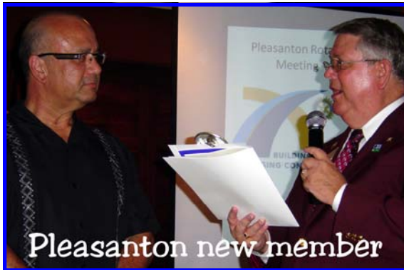
Pleasanton new member