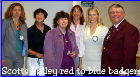
Scotts Valley red to blue badgers